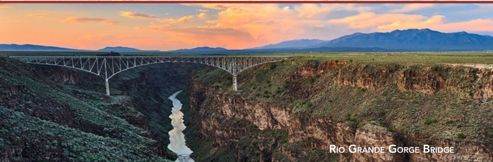
RIO GRANDE GORGE BRIDGE