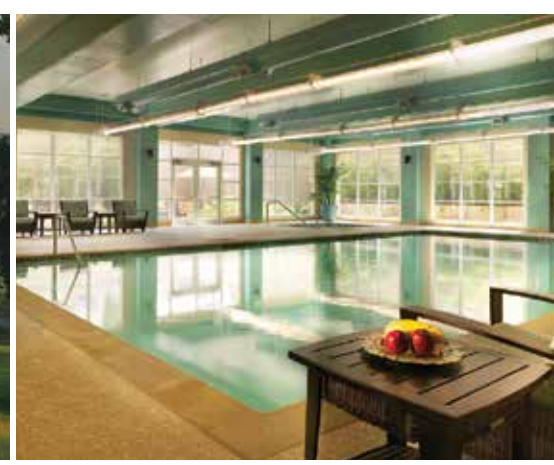
Proud sponsor of LeadingAge Ohio